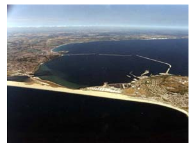
Portland Harbour - work on the new 560 berth marina at Osprey Quay has just begun.