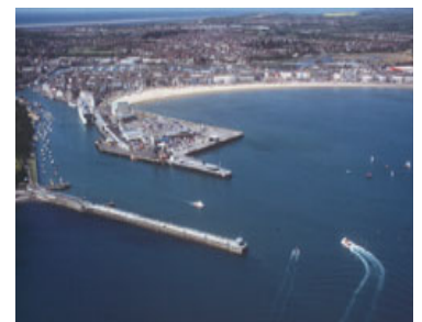
The entrance to Weymouth Harbour, the site is to be redeveloped including a new marina

If all goes to plan, Portland will be the first venue in England to build a permanent venue for the 2012 Games.