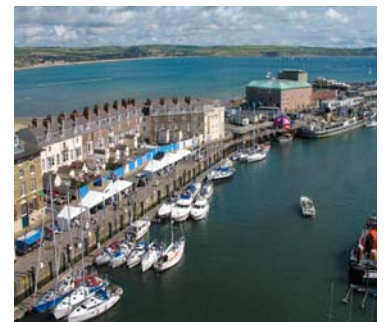
Weymouth Harbour during Marine-Ex 2007